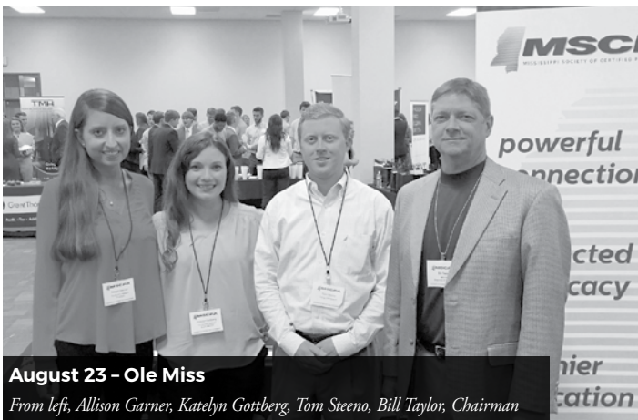
August 23 - Ole Miss