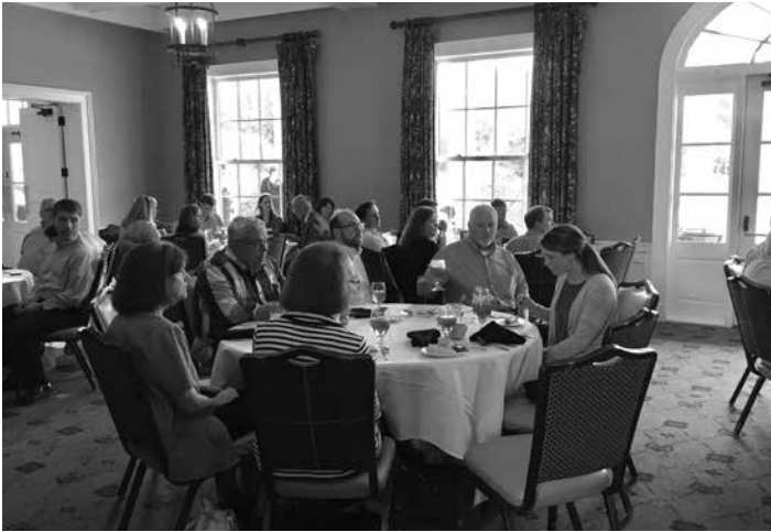
Central Chapter met on August 29 at River Hills Country Club with 75 in attendance for lunch and CPE.