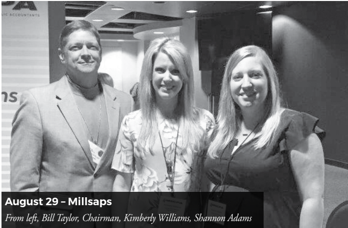
August 29 - Millsaps

Members of the MSCPA Young CPA Network visited with college accounting students at the Meet the Firms events and talked with them about their future plans for becoming a CPA and introduced the MSCPA to them.