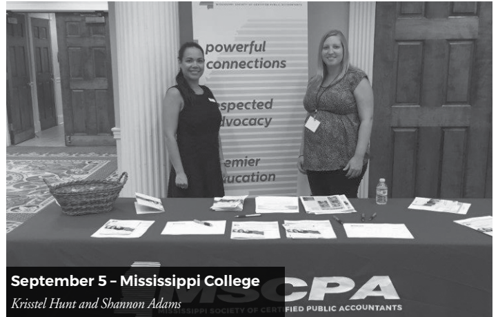
September 5 - Mississippi College