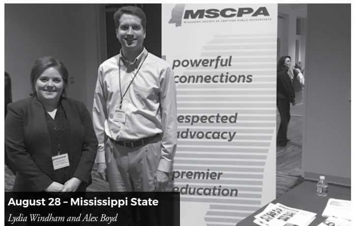
August 28 - Mississippi State