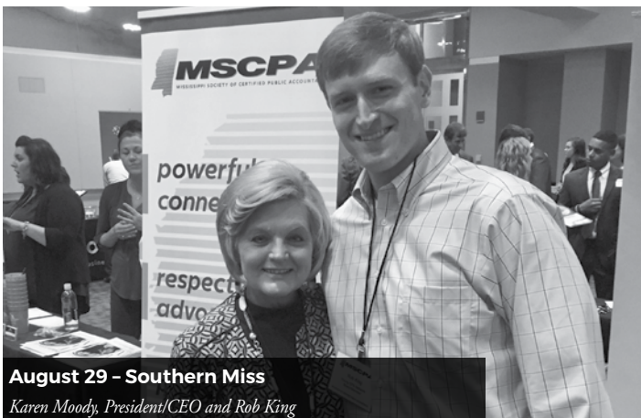
August 29 - Southern Miss