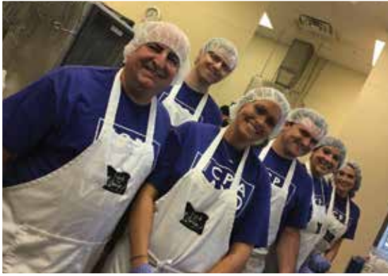
Members volunteering at Feed My Sheep in Gulfport.