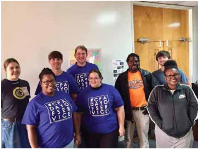
Members and students volunteering at Helping Hands in Cleveland.