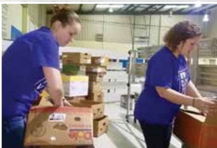
Members volunteering at Salvation Army in Tupelo.