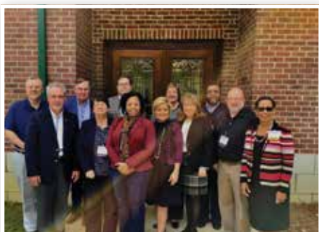
Awards, Education and Scholarships Committee members