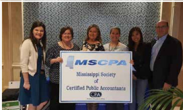
Not-for-Profit Committee members