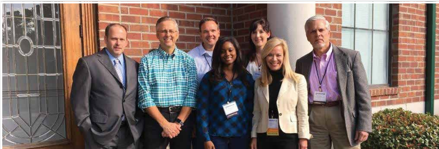
BVLS Committee members