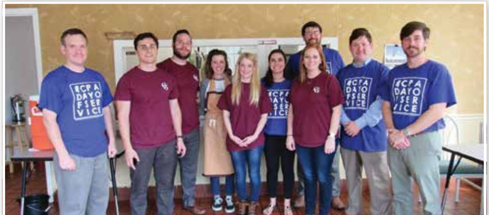
Members volunteering at Stewpot in Natchez.