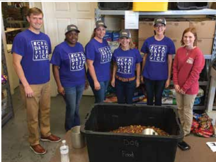
Members and students volunteering at Edwards Street Fellowship Center in Hattiesburg.