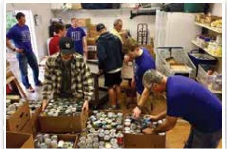
Members and students volunteering at The Pantry in Oxford.