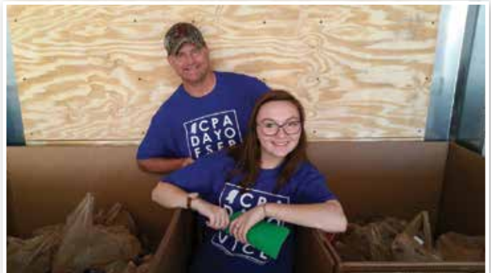
Members and students volunteering at Kroger in Clinton.