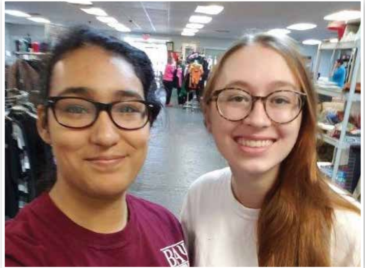
Students volunteering at Salvation Army in Starkville.