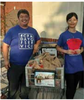
Members volunteering at Kroger in Madison.