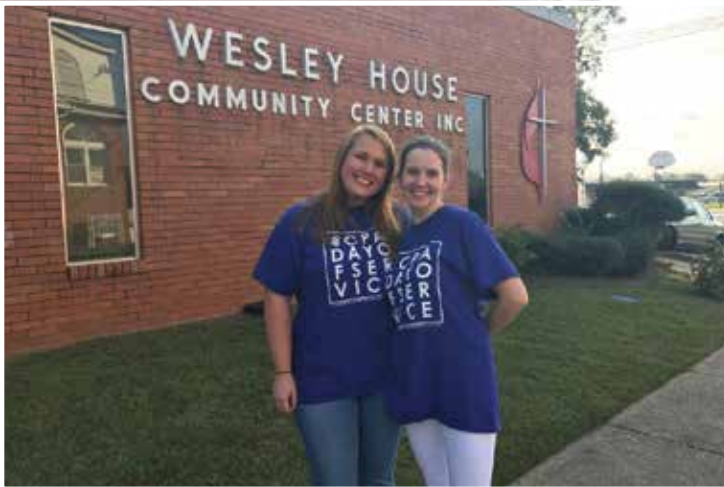
Members volunteering at Care Lodge, Love's Kitchen, and Wesley House Community Center in Meridian.