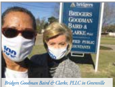
Bridgers Goodman Baird & Clarke, PLLC in Greenville