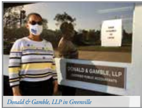
Donald & Gamble, LLP in Greenville