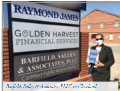
Barfield, Salley & Associates, PLLC in Cleveland