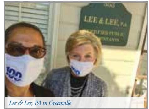
Lee & Lee, PA in Greenville