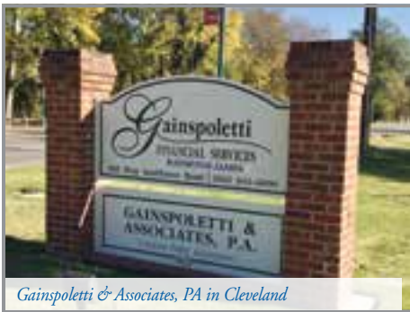
Gainspoletti & Associates, PA in Cleveland