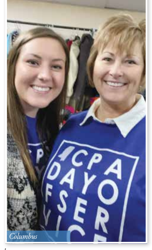
Members volunteering at the Salvation Army in Columbus.