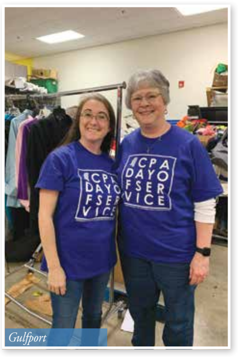
Members volunteering at Harrison County SPCA Thrift Store in Gulfport.