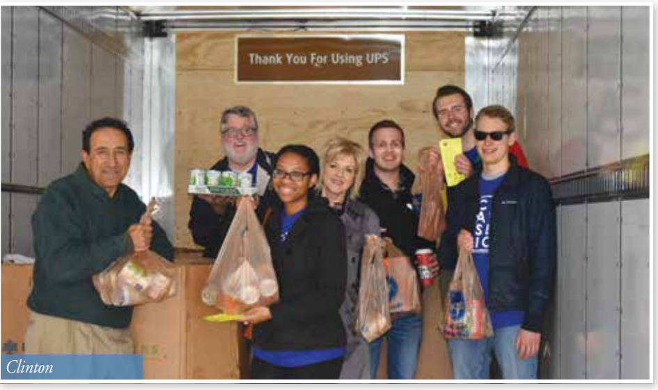
Members volunteering at Kroger in Clinton.