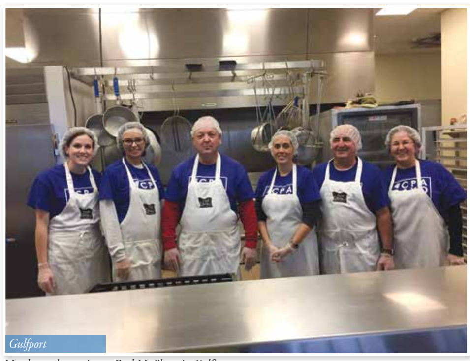
Members volunteering at Feed My Sheep in Gulfport.