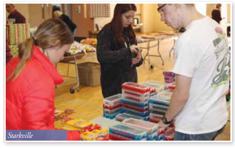
Members volunteering in Starkville.