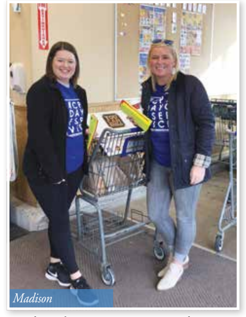
Members volunteering at Kroger in Madison.