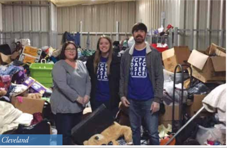
Members volunteering at Salvation Army in Cleveland.