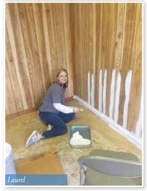
Members volunteering at Glory House in Laurel.