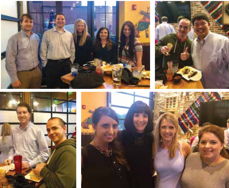
The MSCPA Young CPA Network hosted a social at Sombra Mexican Kitchen in Ridgeland on April 26.