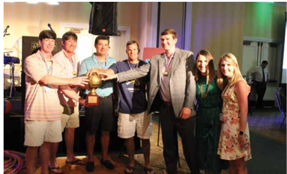
2018 Champions – Team MSCPA

Join us at the beach party on Saturday afternoon in Sandestin. There will be tents, drinks, and sponsor giveaways.