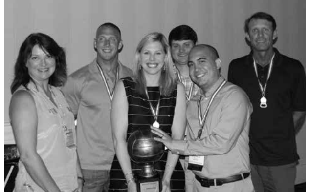
2015 Champions – Team Horne

Corn hole has been added to the beach party!