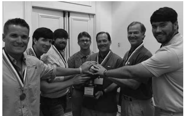
2016 Champions – Team MSCPA