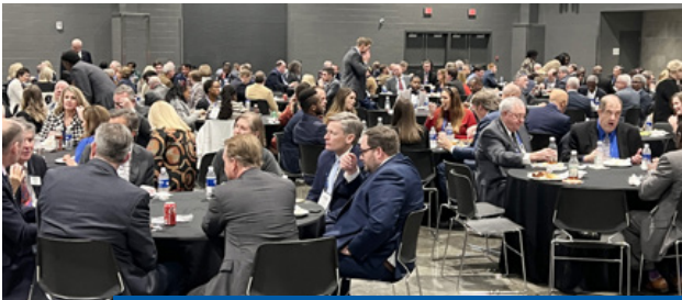
Attendees at the MEC Capital Day 2024